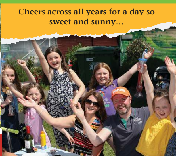
Cheers across all years for a day so sweet and sunny...