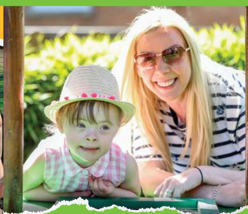
And picture-perfect moments to remember. Thank you!