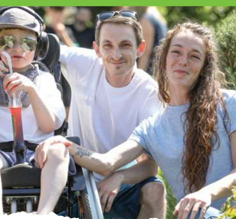
and laughter in the air...